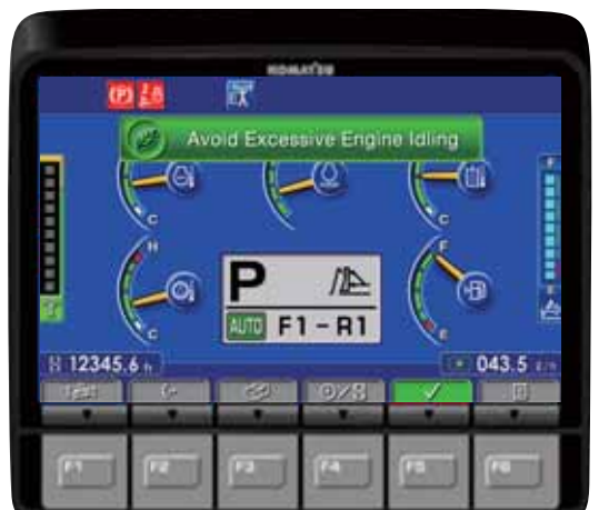
Eco gauge, eco guidance and fuel consumption gauge help to further reduce consumption.