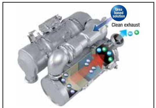
New heavy-duty after treatment system combines the Komatsu Diesel Particulate Filter (KDPF) and Selective Catalytic Reduction (SCR) to fully comply with EU Stage IV emissions.