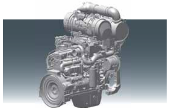
New, low consumption Komatsu SAA6D114E-6 engine for greatly increased productivity.