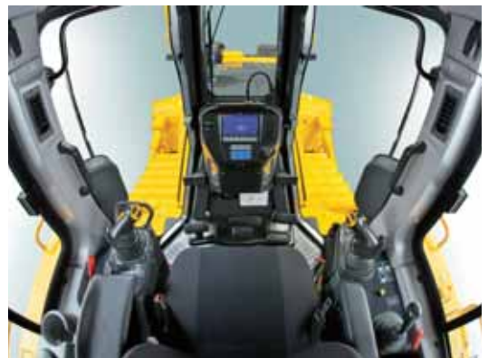
Fully air suspended operator station ensures maximum operator comfort and an excellent view on the blade.