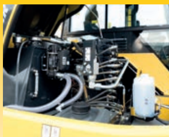
Enhanced service access