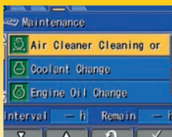
The multifunction monitor panel with maintenance and service information