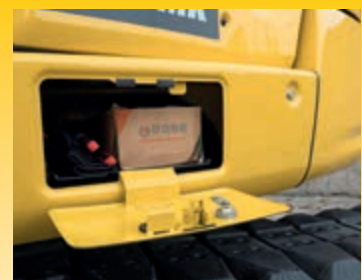
Generous storage compartment under the cab