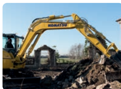
Hose burst valves on boom and arm cylinders