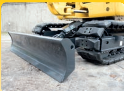
New, improved blade design