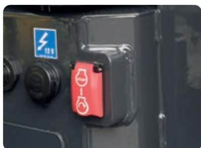
Secondary engine shutdown switch