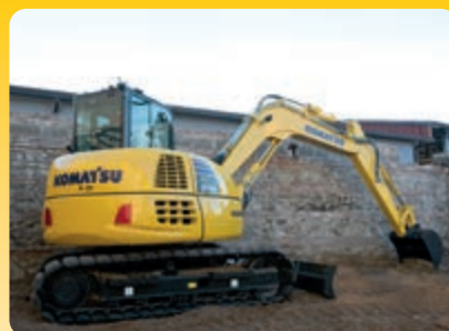
A reduced front swing radius and boom swing function make trench digging a cinch