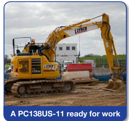
A PC138US-11 ready for work

Most of this new equipment has gone straight onto the vast £1.5bn A14 Cambridge to Huntingdon Improvement Scheme. This is the biggest Highways England project currently underway, running 26 miles from Huntingdon to north of Cambridge. As lead supplier of plant on the project, Lynch have 150 operators and machines on the project, as well as tippers, sweepers and fuel bowser lorries. A large percentage of the new machinery