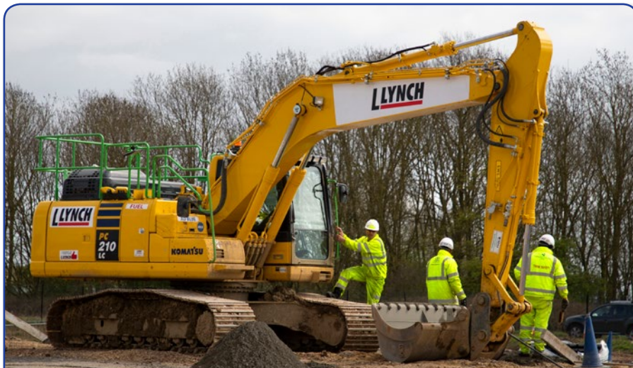
One of thirty Komatsu PC210LC-11 excavators on the A14 project

Lynch have clearly been impressed with the performance of these new Komatsu machines and customer feedback has been overwhelmingly positive, leading to further discussions about other products including dozers and dump trucks already under way. As such, this is very much seen as the start of a long term working relationship!