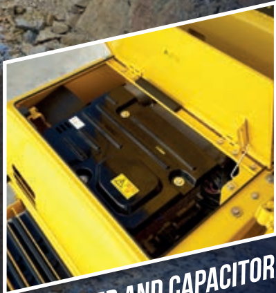
INVERTER AND CAPACITOR