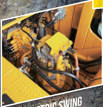
ELECTRIC SWING MOTOR-GENERATOR