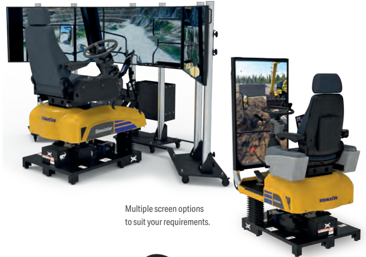
Multiple screen options to suit your requirements.