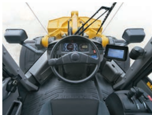
New operator seat with integrated EPC lever console ensures maximum operator comfort.