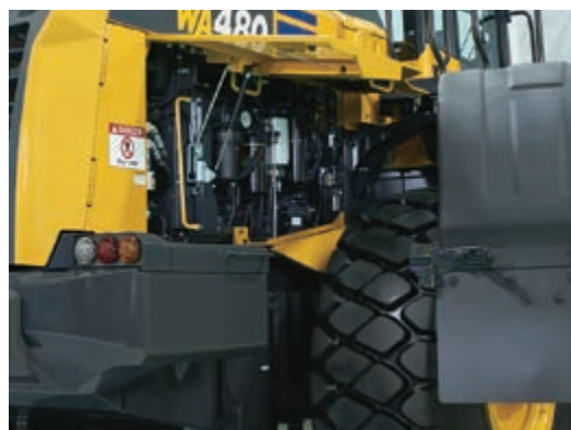
New, improved gull-wing type engine doors for easier and safer maintenance access.